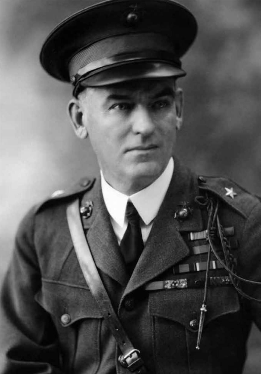
Logan Feland, pictured here as brigadier general, was initially the executive officer of the 5th Regiment. However, when the unit was thrown into the breach to stem the German advance at Château-Thierry, Feland was in the thick of the fighting. At Belleau Wood in June 1918, when the halt in the German advance was turned into a retreat, Feland was given command of all troops in the Wood.