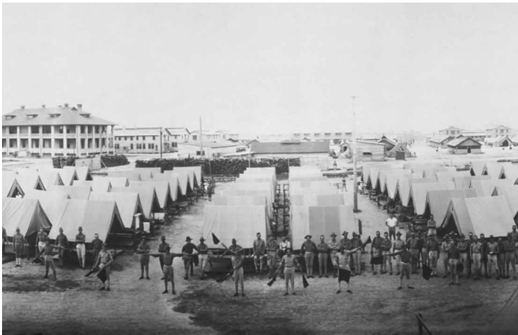
Marines of the 3d Brigade stationed at Fort Crockett on Galveston Island, Texas, demonstrate their skills with semaphore by spelling out "Marines" with flags.