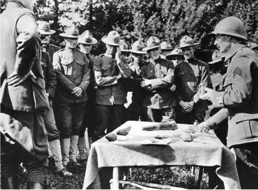
Marines receive instruction from French veterans on using hand grenades.

well-trained condition of the individual Marine, this [situation] did not vitally affect his professional ability as was so distinctly shown by his later accomplishments.