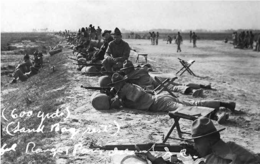
U.S. Marines practice marksmanship while going through recruit training at Marine Barracks Parris Island, South Carolina, during World War I.

The following table gives a list of the special schools at the Parris Island Recruit Depot and the number of graduates from each during the period between the outbreak of war and the date the armistice became operative: