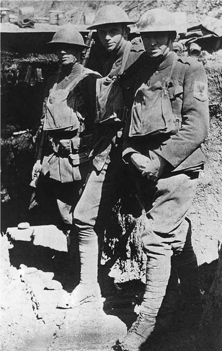
U.S. Navy corpsmen served alongside the Marines in combat, in the trenches, and all throughout the war.

The following is a summary of the casualties sustained by the 4th Brigade from 15 March to 11 November 1918, as published in General Orders, No. 66, 2d Division, American Expeditionary Forces, dated 2 July 1919: