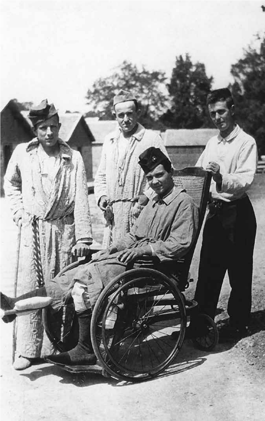
Marine casualties gather for a photograph during World War I.